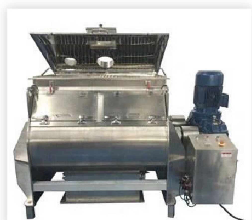
Double Shafts Paddle Mixer