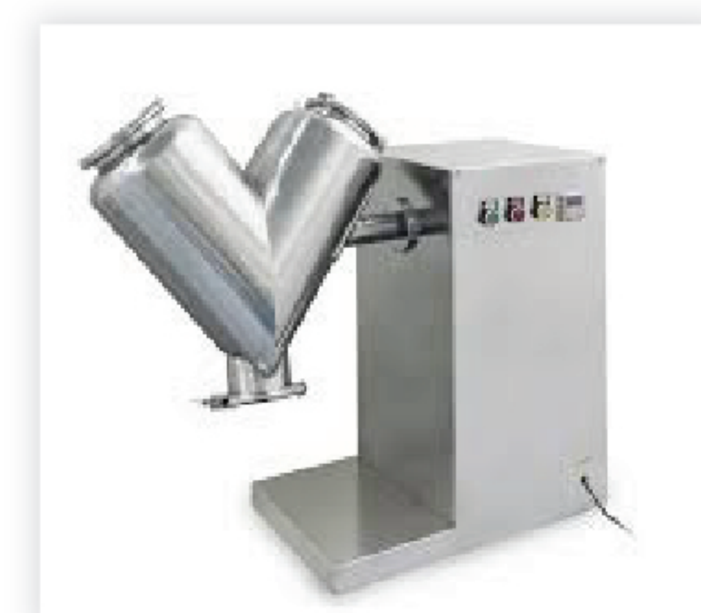
Lab V Mixer